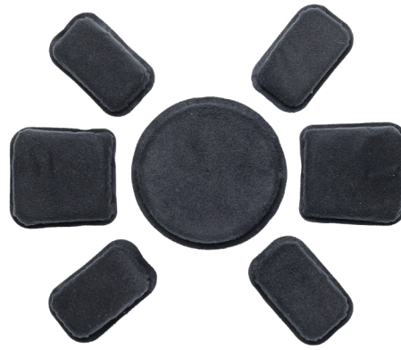
AIRESUPPORT SUSPENSION SYSTEM