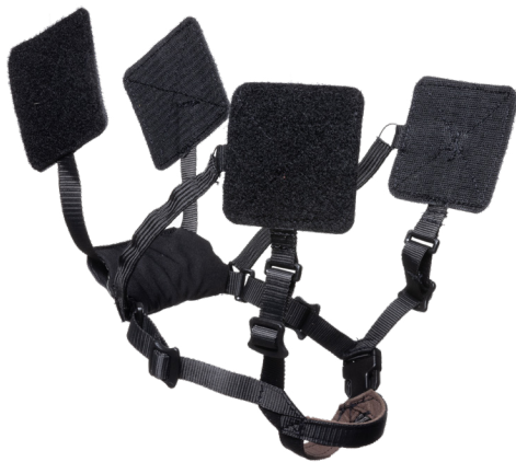
AIRELINK PLUS DIAL RETENTION SYSTEM