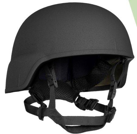
REGULAR-CUT / NO ACCESSORIES