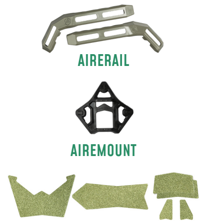
OPERATIONAL LOOP SYSTEM