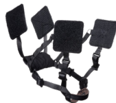
AIRELINK PLUS DIAL RETENTION SYSTEM BLACK, FOLIAGE GREEN, TAN, OLIVE GREEN COYOTE BROWN