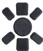
AIRESUPPORT STANDARD SUSPENSION SYSTEM BLACK, GREEN