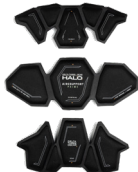
AIRESUPPORT PRIME ADVANCED SUSPENSION SYSTEM BLACK, GREEN