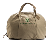
CARRYING BAG TAN / COYOTE