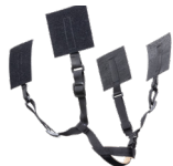
AIRELINK STANDARD RETENTION SYSTEM BLACK, FOLIAGE GREEN, TAN, OLIVE GREEN, COYOTE BROWN