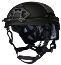
HIGH-CUT W/ AIRELOCK SYSTEM