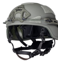
REGULAR-CUT W/ AIRELINK PLUS & AIRESUPPORT PRIME