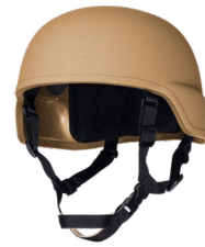
REGULAR-CUT W/ AIRELINK & AIRESUPPORT