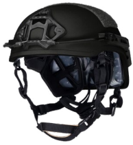
HIGH-CUT W/ AIRELOCK SYSTEM