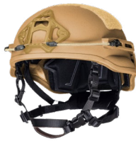
MID-CUT W/ AIRELINK PLUS & AIRESUPPORT PRIME