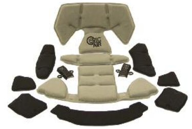
P4 Team Wendy Epic Air Liner System 3 main pads for impact protection and an assortment of ergonomically designed comfort pads. Compatible with all styles of communication headsets.