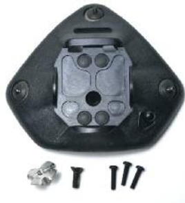
NOR3 Three hole NVG shroud. In Black or Tan.