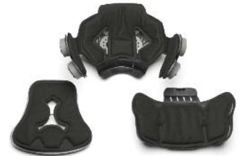
P9 Team Wendy Revolve Pad System 3 piece line system constructed of Zorbium foam with outer wicking fabric.