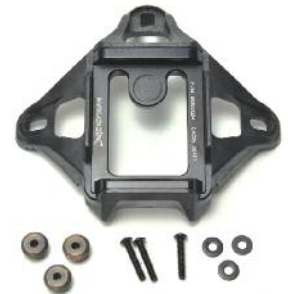
WIL3 Shroud Three hole NVG Shroud w/long life metal insert. Available with lanyard (not shown). In Black, Tan, or Olive Green.