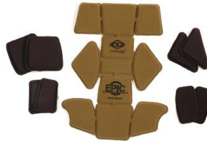
P7 Team Wendy Epic Single Piece version of the Epic Air without the various communication wire lifters. One size fits most helmet sizes and shapes.