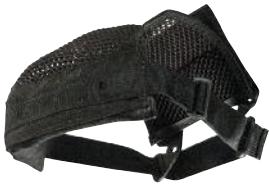
P5 Mesh Suspension 4 point single piece unit, adjustable for all sizes and shapes of helmets. Breathable and extremely light. Temple to temple leather frontal pad, mesh crown. Single point circumference adjustment. Large rear Hook and Loop Fastener adjustment for depth. Not suitable for Boltless retentions. Black only.