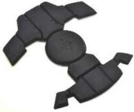
P1 Single Pad Single piece fabric cover over closed foam suspension pad. Fits all sizes and shapes of helmets. 3/4" thick. Hook coin fasteners. In Black only.