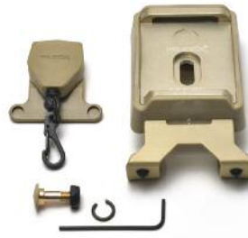
WIL1 Shroud Single hole NVG shroud. In Black or Tan.