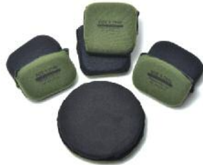
P6 Oregon Aero 7-Pad 3/4" and 1/2" suspension system consisting of 7 fabric-covered dual density foam pads (2 traps, 4 oblongs, 1 circular crown). Hook coin fasteners. In reversible Green/Black only.