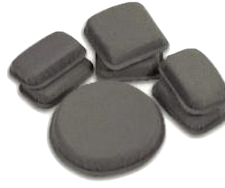
P3 Deluxe 7-Pad (ZAP) 3/4" suspension system consisting of 7 fabric covered, multi density foam pads. (2 traps, 4 oblongs, 1 circular crown). Hook coin fasteners. In Gray or Black only.