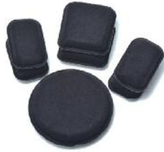
P2 Standard 7-Pad 3/4" suspension system consisting of 7 fabric covered, single density foam pads. (2 traps, 4 oblongs, 1 circular crown) Hook coin fasteners. In Black only.