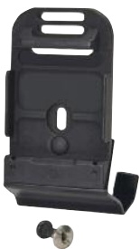
NOR1 Single hole NVG shroud. In Black.