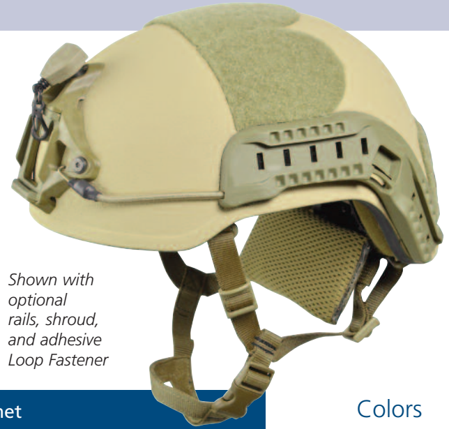
Shown with optional rails, shroud, and adhesive Loop Fastener