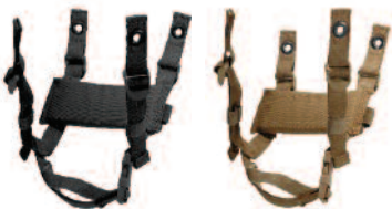
ASPS H-Back System. Bolted or Boltless. In Black, Tan, Foliage Green or Olive Green.