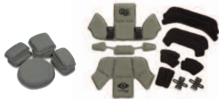
ACH padding EPICAir Liner System