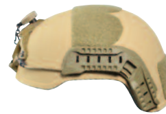
ASR ArmorSource Rail and Pre-Cut Adhesive Loop Velcro