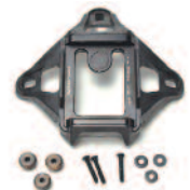
WIL 3 Shroud In Black, Tan, or Camo Green