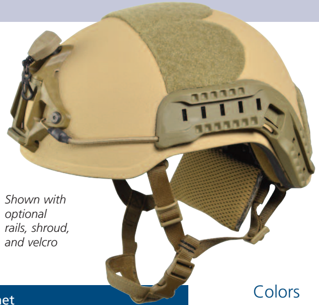
Shown with optional rails, shroud, and velcro