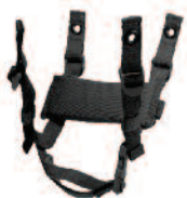
ASPS H-Back available in Black, Tan, Foliage Green or Olive Green.