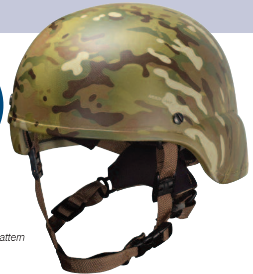
Shown with custom dipped multi-cam pattern and BOA retention