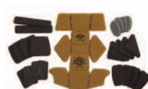
EPIC Pad System Also available in black