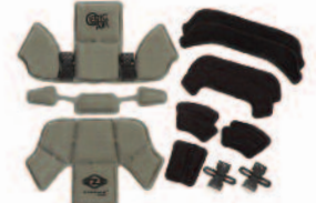
EPIC Air Liner System