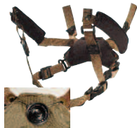
BOA 4-point Retention System with adjustable fit dial