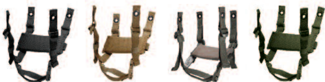
ASPS H-Back System. Retention System available in Black, Tan, Foliage Green or Olive Green.