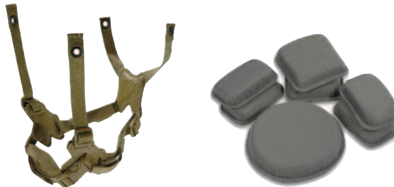
ASPS X-Back System with Pads. Available in Tan only.

This document gives only a general description of the product(s) and except where expressly provided otherwise shall not form part of any contract. From time to time, changes may be made in the products or the conditions of supply, which can cause slight variances in final weights. ArmorSource LLC, reserves the right to change product specifications without prior notice.