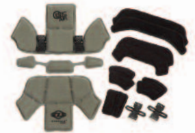
EPIC Air Liner System

This document gives only a general description of the product(s) and except where expressly provided otherwise shall not form part of any contract. From time to time, changes may be made in the products or the conditions of supply, which can cause slight variances in final weights. ArmorSource LLC, reserves the right to change product specifications without prior notice.