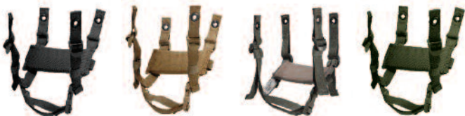
ASPS H-Back System. Retention System available in Black, Tan, Foliage Green or Olive Green.